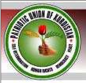
PUK emblem ( www.puk.org , 22 December 2008)

The Patriotic Union of Kurdistan (PUK) , led by Iraqi President Jalal Talabani (IHEC website, 22 December 2008).