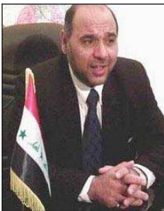
Abbas al-Bayyati (www.alsumaria.tv, 1 November 2007)