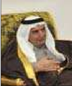
Amir al-Dulaymi ( www.aswatnews.org , 8 June 2008)

Al-Anbar Tribes Chieftains and Intellectuals Bloc , led by Amir Abd-al-Jabbar Ali Sulayman Bakr al-Dulaymi (IHEC website, 22 December 2008).