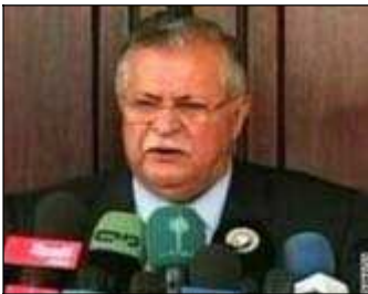
Jalal Talabani ( www.puk.org , 22 December 2008)

Party Description: Founded by Talabani in 1975 after separating from the Kurdistan Democratic Party, the PUK is headed by liberal leaders and is very active in the southern part of Kurdistan in Iraq. The party has intimate relations with the United States and Iran but has cold relations with Turkey ( Al-Jazirah.net , 23 May 2006).