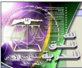
Party emblem

The Iraqi Islamic Action Organization , led by Muhammad Jasim Muhsin Abbas (IHEC website, 22 December 2008).