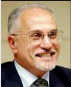
Husayn al-Shahristani (Al-Jazirah.net, 4 May 2005)

Independents , led by Husayn Ibrahim Salih al-Shahristani (IHEC website, 22 December 2008).