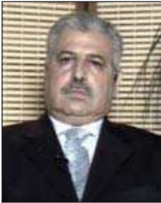
Athil al-Nujayfi ( www.iraqyoon.net , 22 December 2008)

Unified National Al-Hadba Grouping , led by Athil Abd-al-Aziz Muhammad al-Nujayfi (IHEC website, 22 December 2008).