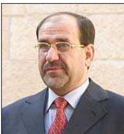
Nuri al-Maliki ( al-daawa.org , 22 December 2008)

Party Description: The Da'wah Party is one of Iraq's oldest Islamic parties. It was established by Iraqi cleric Ayatollah Baqir al-Sadr in 1968. The party includes various groups, some of which exist in the Arabian Gulf and others in Lebanon. The party does not favor the Iranian style of religious rule ( Al-Jazirah.net , 27 May 2007).