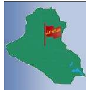
Party emblem