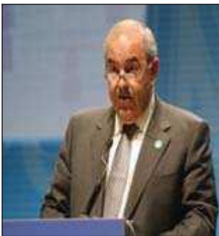
Dr Iyad Allawi (www.wifaq.com, 22 December 2008)

Party Description: Founded as an opposition party in 1991, the INA is a movement that aims to preserve Iraq's territorial integrity and prevent any interference in Iraq's domestic affairs. It strives to achieve a true democracy and enact laws that respect human rights; it also seeks to build a modern Iraq based on the principles of freedom and political pluralism (www.wifaq.com, 20 December 2008).