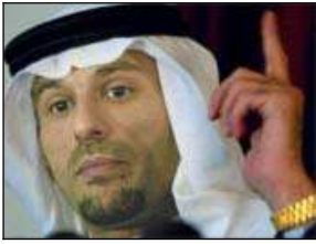
Ali al-Sulayman (www.asharqalawsat.com, 24 September 2008)

The National Front for the Salvation of Iraq , led by Ali Hatim al-Sulayman (IHEC website, 22 December 2008).