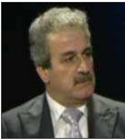
Rummy Hikari (bet-nahrain.net, 22 December 2008)

Party Description: Established on 1 November 1976 after holding its founding conference in the United States, the Bayt Nahrayn Democratic Party identifies itself as a democratic party representing the interests of the Assyrians inside and outside Iraq. The party strives to gain the legitimate rights of the Assyrian people and calls for establishing a pluralistic, federal, and democratic rule in Iraq. It also supports the Kurdistan Region Government and the Kurdish people's rights to self-determination (bet-nahrain.net, 20 December 2008).