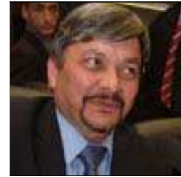
Ibrahim al-Ulum (iraqidev.com, 17 July 2008)

Party Description: Independent political entity formed by Dr Ibrahim Muhammad Bahr al-Ulum, former minister of oil (islamonline.net, 1 January 2005). Muntasir al-Amarah, a prominent member of the grouping, noted that the grouping comprises figures who are not supported by any internal or foreign parties and who depend on their own money to run in the elections. He criticized the ruling parties in Iraq for failure to shape economic and administrative policies that are appropriate to the Iraqi society (www.almowaten.com, 15 December 2008).