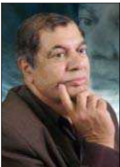
Hashim al-Musawi (www.islamicdawaparty .org, 22 December 2008)