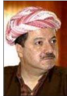
Mas'ud Barzani ( www.kdp.se , 22 December 2008)

Party Description: Established by Mustafa Barzani (1903-1979) in 1946, the KDP largely relies on the Barzan tribe and is mainly active in the northern city of Arbil. The party says that it works hard to strengthen the basis of the federal state and the Kurdistan National Assembly which was made by "the sacrifices of thousands of our people" and adds that it works hard to mobilize international support for it. It claims that it is becoming the strongest political party in Kurdistan ( www.kdp.se , 22 December 2008). The KDP enjoys good relations with Turkey, the United States, and the West but has cold relations with Iran ( Al-Jazirah.net , 23 May 2006). The Kurdistan Region Government is jointly run by the KDP, the PUK, and other Kurdish parties ( www.krg.org , 29 June 2007).