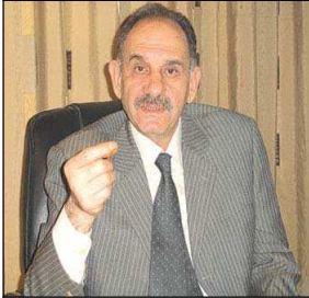
Salih al-Mutlaq ( www.asharqalawsat.com , 22 December 2007)

The Iraqi Front for National Dialogue , led by Salih Muhammad Mutlaq al-Dulaymi, aka Salih al-Mutlaq (IHEC website, 22 December 2008).