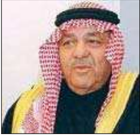
Khalaf al-Ulayyan ( www.akhbaar.org , 3 July 2007)

The Iraqi National Dialogue Council , led by Khalaf Ulayyan Khalaf Jasim al-Ulayyan (IHEC website, 22 December 2008).