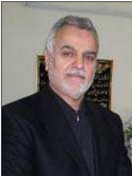
Tariq al-Hashimi (www.iraqiparty.com, 22 December 2008)

Party Description: According to its website, iraqiparty.com, the Iraqi Islamic Party is a Sunni party founded in 1960 and evolved from the Muslim Brotherhood Movement. It is led by Tariq al-Hashimi, the party's secretary general and one of Iraq's two vice president since 2005. The party's political program includes the following: