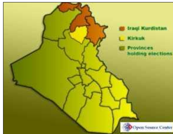
Provinces Holding Elections (13 January 2009)

According to an IHEC official quoted by Al-Malaf.net , the elections will be held in 14 out of Iraq's 18 governorates . The elections will not be held in the governorates of Arbil, Dahuk, Al-Sulaymaniyah, and Kirkuk, the official added. She also reported that the " number of voters is [approximately] 14,780,000 in the 14 governorates, that the number of polling centers is 6,500 , and that the number of seats is 440" (3 December 2008).