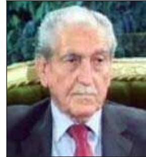
Nasir al-Jadirji (www.ahewar.org, 2 February 2008)

Party Description: The Democratic National Party was established by Kamil Rif'at al-Jadirji in 1946 and comprised Shiite, Sunni, and other religious scholars and clergymen (asharqalawsat.com, 15 May 2003). It identifies itself as a national party that believes in equality among all Iraqis and says that it supports federalism in principle, provided that it is not based on sectarianism (www.ahewar.org, 2 February 2008).