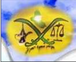
Party emblem (www.sahwataliraq.com, 22 December 2008)

The Awakening of Iraq Conference , led by Shaykh Ahmad Buzay Futaykhan Abu-Rishah (IHEC website, 22 December 2008).