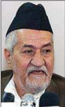
Adnan al-Dulaymi ( www.aawsat.com , 4 August 2008)

The General Conference of the People of Iraq , led by Adnan Muhammad Salman Butay al-Dulaymi (IHEC website, 22 December 2008).