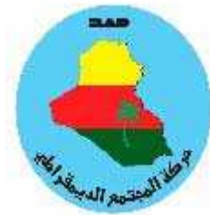
Party emblem ( www.hamadiraq.com , 22 December 2008)