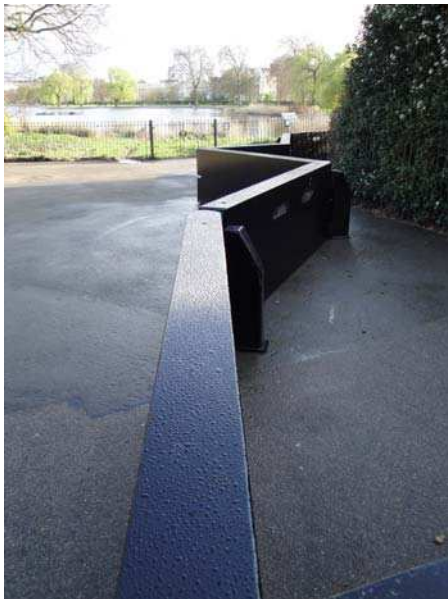
Quick Link Lite barriers