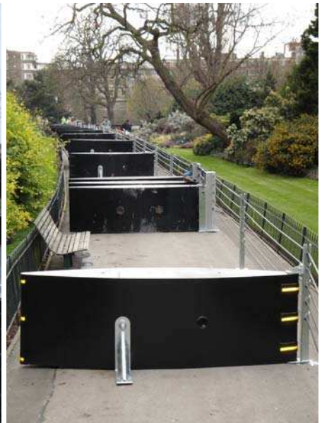
Arrestor wire rope system