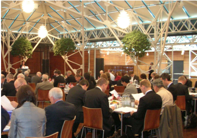
Boeing Supplier Conference in Copenhagen September 11, 2008

logistics support and lean training. Other projects are in accordance with key Danish initiatives in the energy and environment sectors.