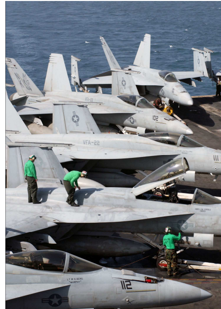
Sailors perform routine maintenance on an F/A-18E Super Hornet aboard the aircraft carrier USS Ronald Reagan.

Key elements of the Integrated Logistics Support program are an extensive onboard fault monitoring system that provides accurate fault detection (>95%) and fault isolation (>98%). Performance-Based Logistics (PBL) programs are demonstrating significant improvements in spare parts availability, repair turnaround time and the optimization of spare parts forecasting. These features enable the Super Hornet to be employed with exceptional operational availability at the lowest possible total ownership costs.